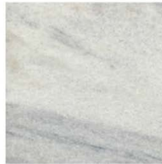
Polycor White Cherokee Honed Countertop