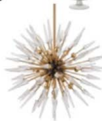
Chandelier Hudson Valley