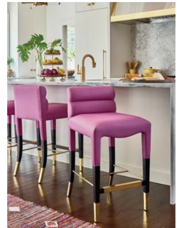
White Cherokee Marble in honed finish.